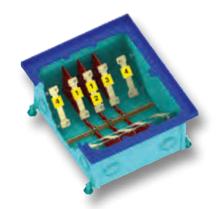
Field Configurable Interior