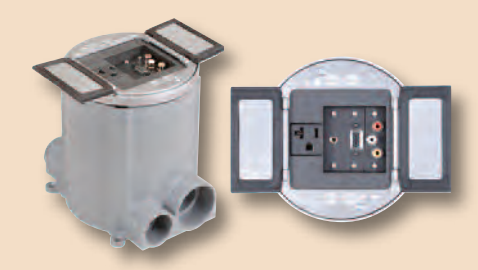
SF-IPS-PB Kit with a SF-BLKT-CV Cover